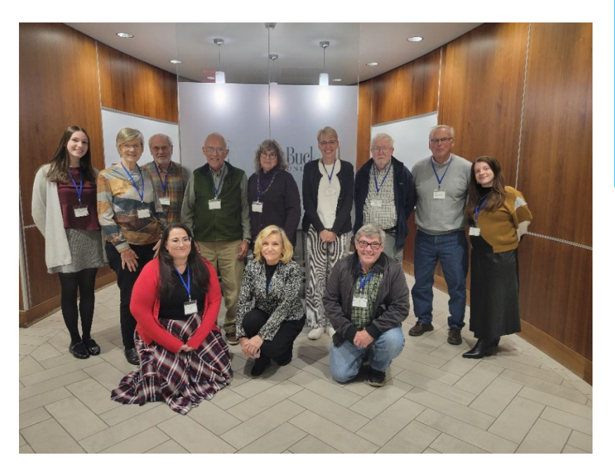
PVS Visitors and staff at Bucknell University in Lewisburg, PA.

The Training Team is already hard at work on our next conference, which will be a National Training Conference in St Louis, Missouri. Keep an eye out for more information soon!